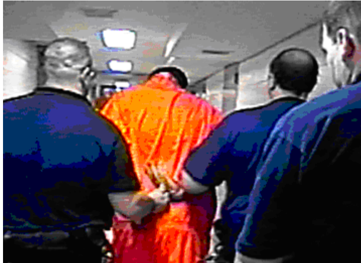
Image 5: Officer uses thumb to gooseneck compliant detainee's wrist.

several instances when MDC staff members bent compliant detainees' arms, hands, wrists, and fingers for no apparent reason. For example, we saw a staff member gratuitously gooseneck a detainee's wrist during a routine escort, even though the detainee was fully cooperative and compliant. (Image 5)