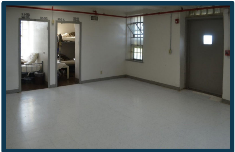
Open Unit and Cells Without Doors